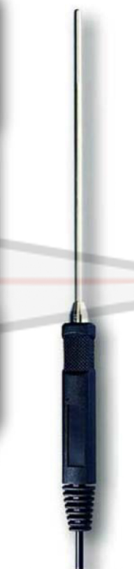
Temp. probe Optional