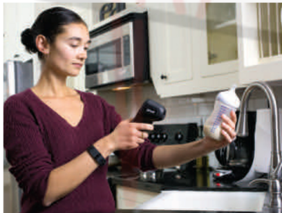
Make sure food is stored and served at a safe temperature