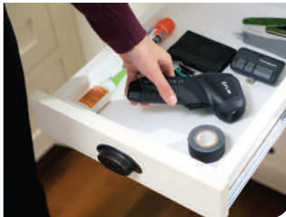
Lightweight and portable, just grab and go