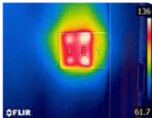
Hot overloaded dimmer switch

The FLIR C2 is the world's first full-featured, pocket-sized thermal camera designed for building industry experts and contractors. Keep it on you so you're ready anytime to find hidden heat patterns that signal energy waste, structural defects, plumbing issues and more. The C2's must-have features include MSX® real time image enhancement, high sensitivity, a wide field of view, and fully radiometric imagery to clearly show where problems are and verify the completion of repairs.