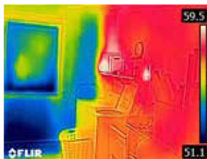
Uninsulated outside wall