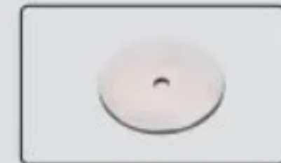
Standard block (included)