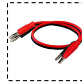
Test Leads (optional)