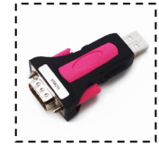
RS232 TO USB