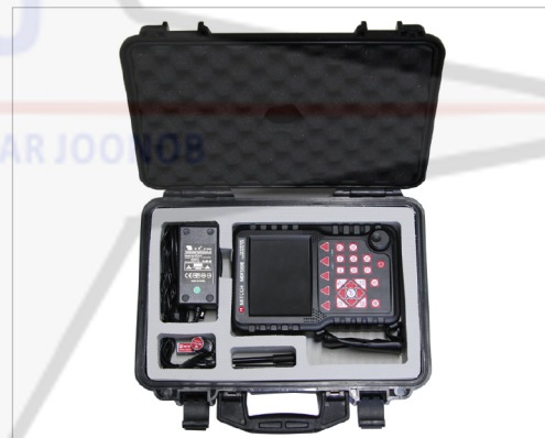
The Whole Unit