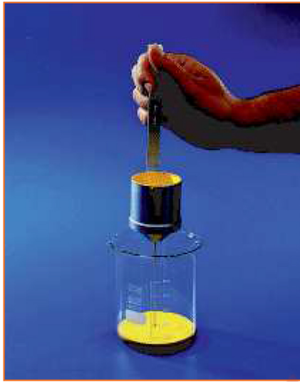
Elcometer FRIKMAR Viscosity Cups with Handle