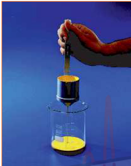
Elcometer 2410 Viscosity Standard Oils for Calibration