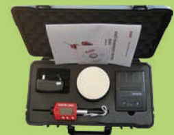
Standard package - HARTIP1800