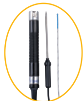
Temperature probe (Optional: NR-31B / TP-500 / TCP-100)