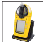
Integral pump and battery charger