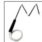
Collapsible sampling probe

For a complete list of accessories, please contact BW Technologies.