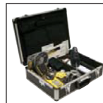
Confined space kit