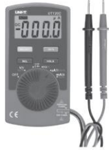
Pocket Size Type Digital Multimeter