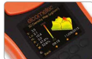
3D Salt Density Profile & Peak Salt Concentration (Hi)