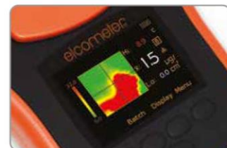
2D Salt Density Map with High/Low Readings