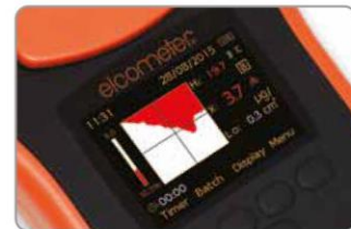
Pass/Fail to User Defined Limits