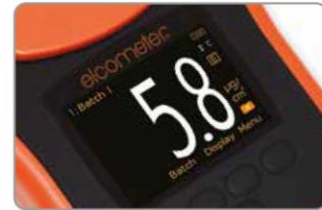
Large Single Reading