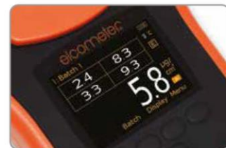
Four Bresle Patch Equivalent Readings