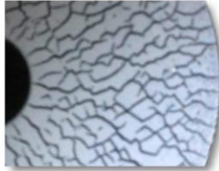
* Indications of MR ® 76S on MTU Test Block