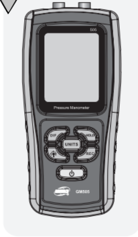
Version : GM505-EN-01