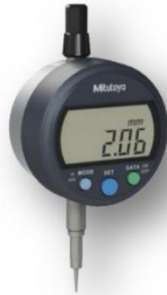
Digital Indicator – DIM543