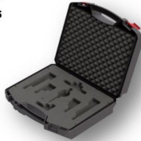
Carrying Case – CCPT44