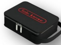
Carrying Bag – CBR230