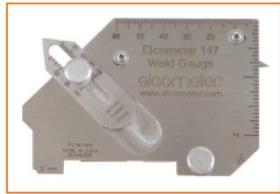
Elcometer 147 Weld Gauge: Side 1