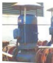
Full visible light