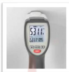
Triple Backlit LCD Display