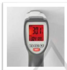
Red Backlight Alert