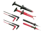
TL220 SureGrip Industrial Test Lead Set See page 57