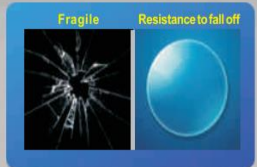
Traditional Quartz lens