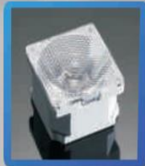
Powerful Nichia UV LEDs