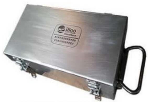
HEAT INSULATION BOX