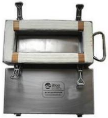
HEAT INSULATION BOX INSIDE