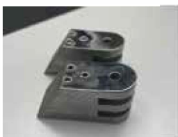
45° Pole (Optional)

The components such as leg poles and cords are easily replaceable. No more downtime due to equipment issues—simply replace the necessary components on the spot and continue with your inspections seamlessly.