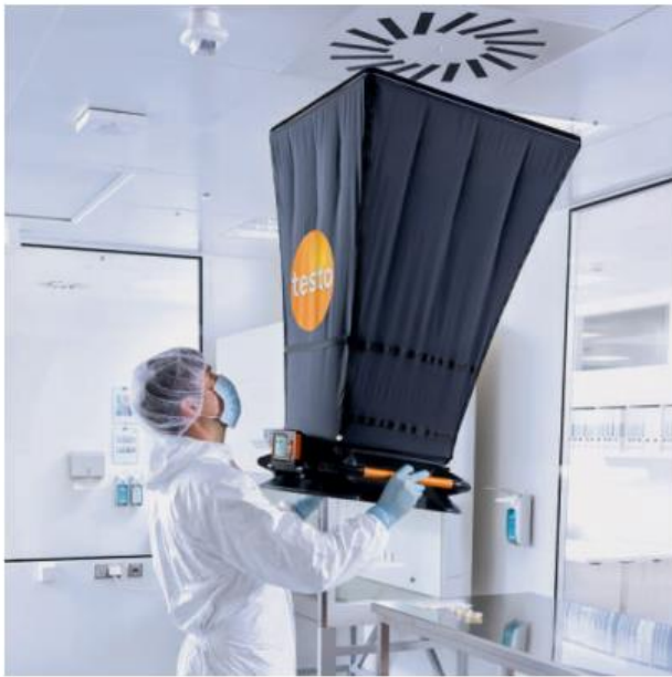
Precision measurements for critical applications