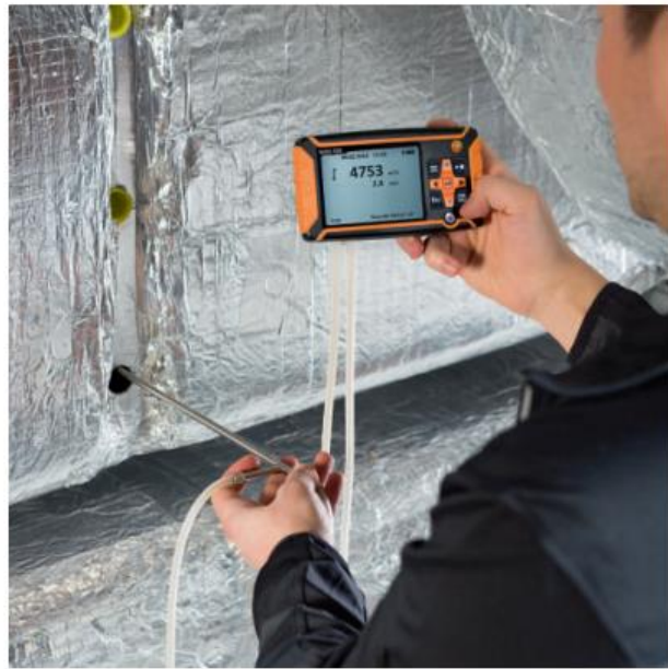
Detachable Differential Pressure (t420) instrument allows Pitot tube measurements in ducts (Pitot tube optional)