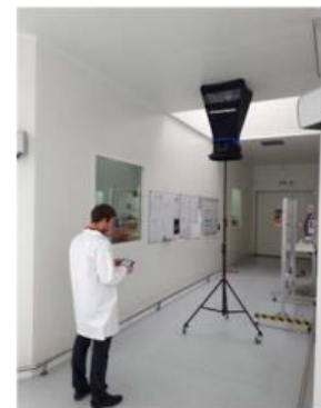
Use with the telescopic tripod