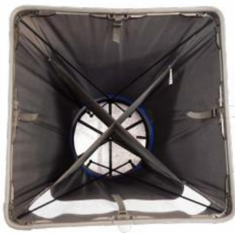
Hood with flow straightener