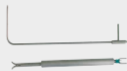
L and S Pitot tubes