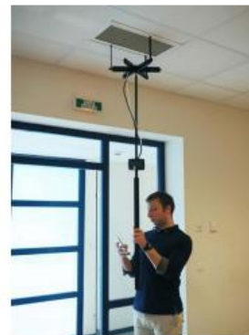
Use with the measurement grid