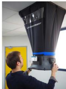
Use of the air flow meter