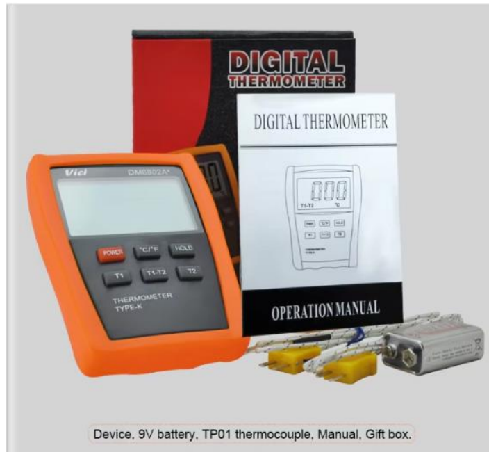
Device, 9V battery, TP01 thermocouple, Manual, Gift box.