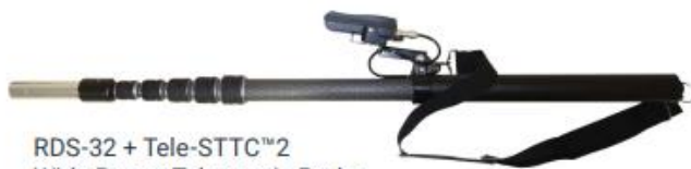
RDS-32 + Tele-STTC™2 Wide Range Telescopic Probe