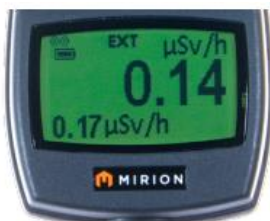
Display with Gamma Probe