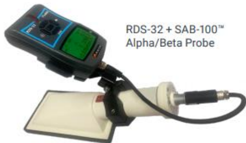
RDS-32 + SAB-100™ Alpha/Beta Probe