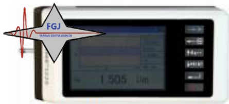
TIME3220 surface roughness tester

TIME®322X portable surface roughness tester is advanced and versatile surface measuring equipment developed and manufactured by Beijing TIME High Technology Ltd.. It has larger testing range and more optional pickup to provide a better solution for surface measurement.