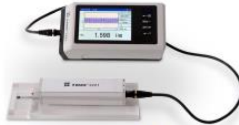
TIME3221 surface roughness tester