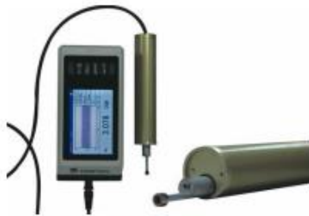
TIME3223 surface roughness tester