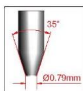
blunt taper indenter