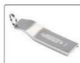
software flash disk