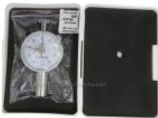
100% Real photographs